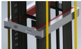
Upper support braces are lined with HDPE for added durability.