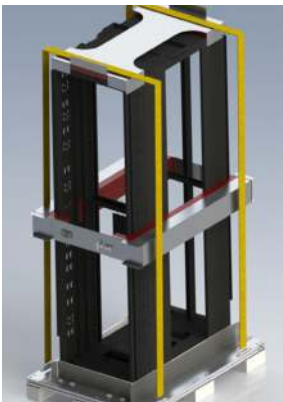
Advanced elastic polymer technology absorbs 45% more shock and vibrations than traditional packaging.

We are industry experts. We don't just research the industry standards and regulations; we actively contribute to the writing process and assist regulatory bodies in the practical application of these requirements. When you use Americase, you get the peace of mind that your hazardous materials, dangerous goods, or high value products, will be safely transported, stored, and moved through your manufacturing and supply chain with the complete confidence that you meet all current, and upcoming regulations.